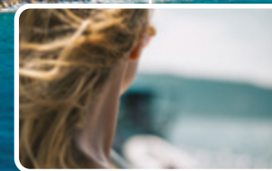
Marbella is fun and leisure.