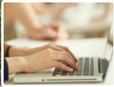
An inspiring coworking space.