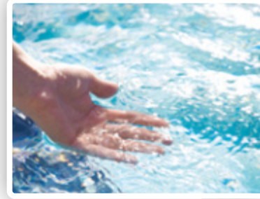
Heated indoor swimming pool.