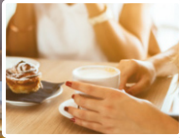
A bright, spacious social club for relaxing with friends.