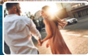
Streets for whiling away the hours shopping.