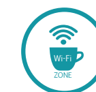
Gourmet Lounge with Wi-Fi