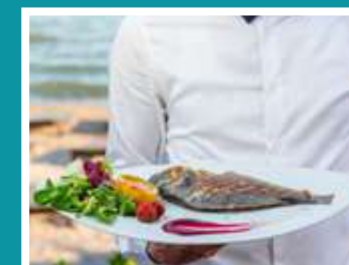
Restaurants and Nightlife