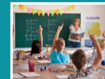
Schools, Clinics, Services