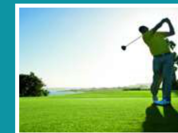
6 Golf Courses