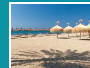
Beaches and Beach Clubs