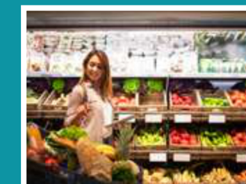
Shops, Banks, Supermarkets