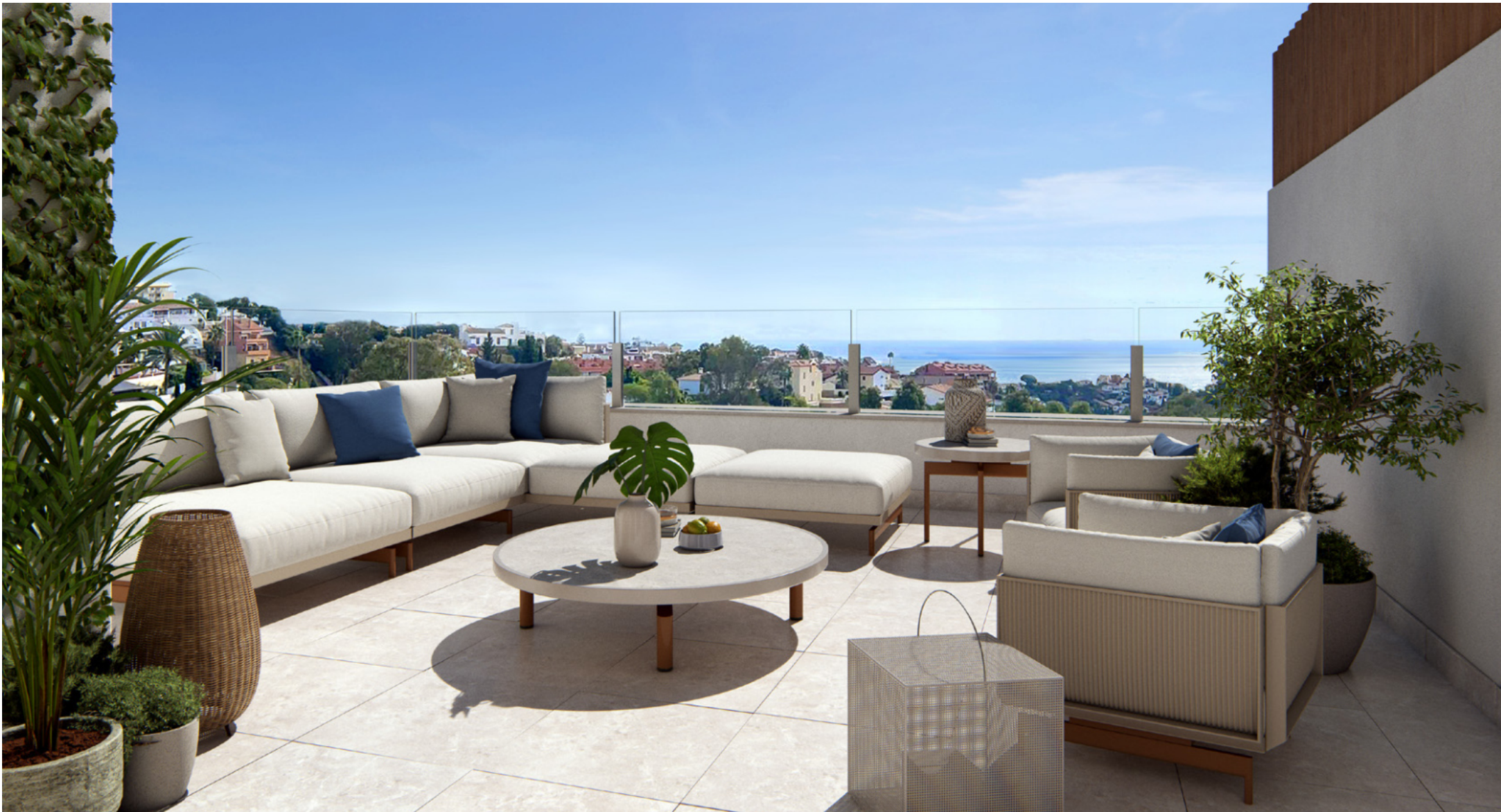
“An elevated position offering countryside, sea or mountain views”.