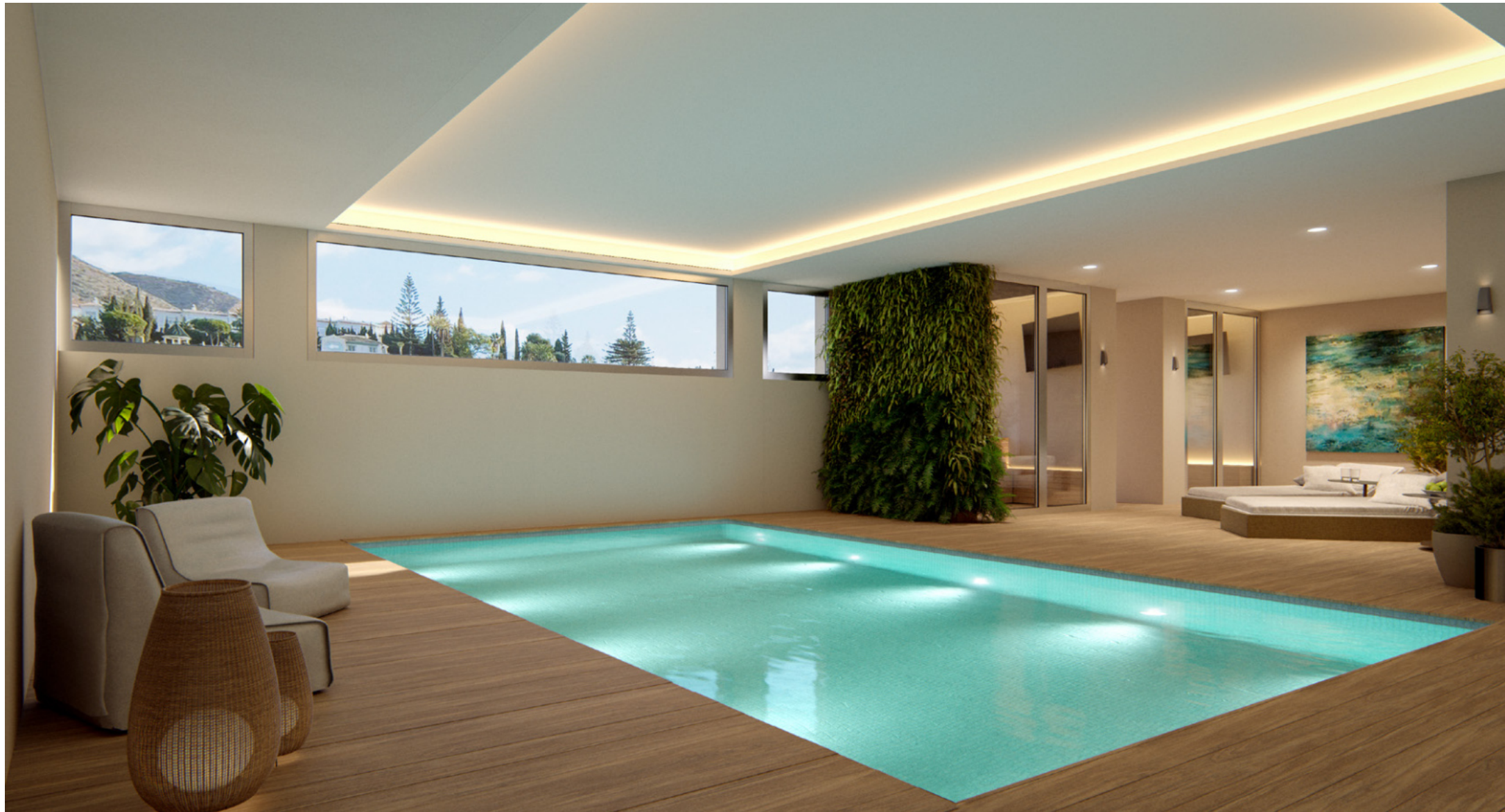
“Enjoy your own private spa without leaving home”.