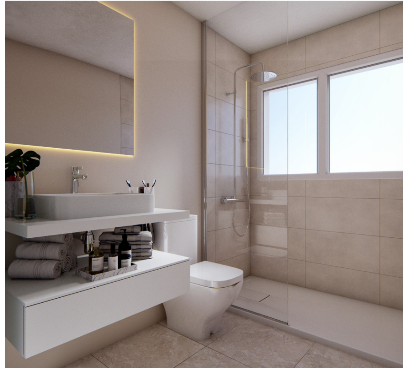
“Cool, calm interiors full of natural light”.