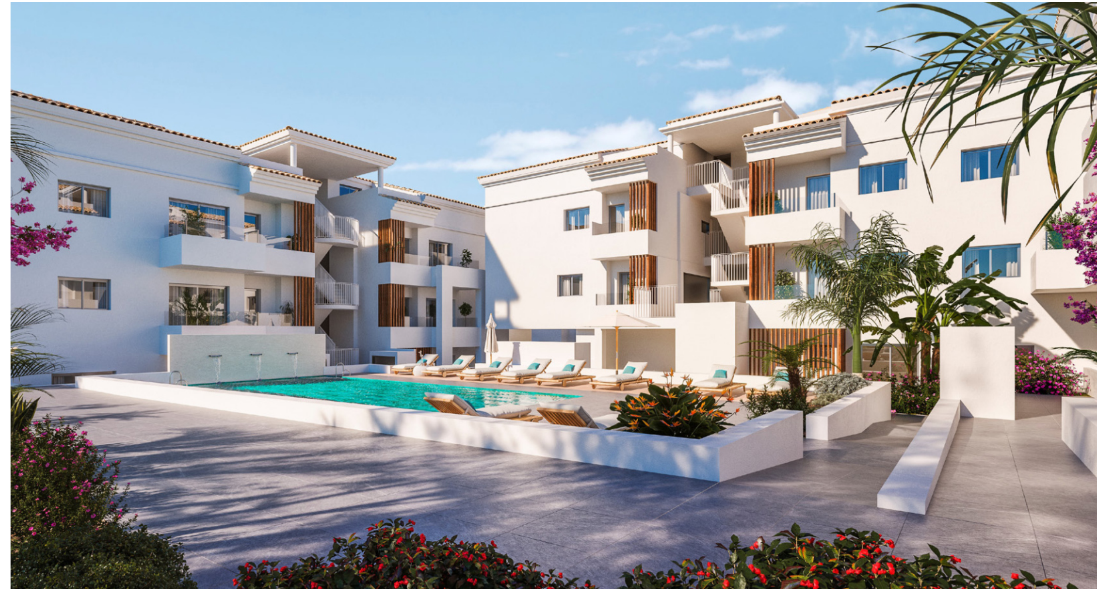
“The central saltwater pool is ideal for fun days in the sun with all the family”.