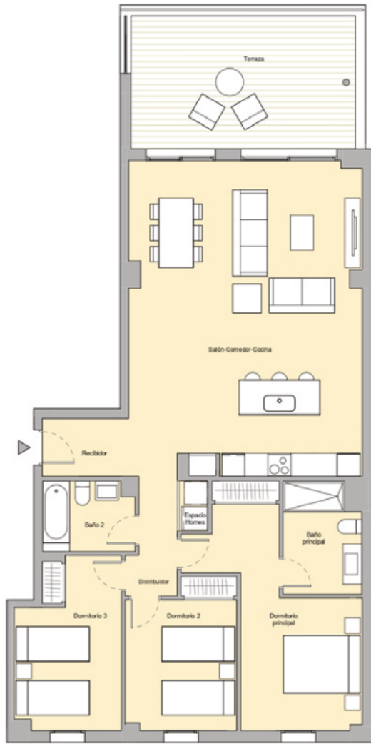
3 BEDROOMS BLOCK A1 LOW LEVEL DOOR 15